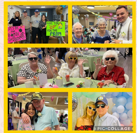
Bakersfield Senior Prom