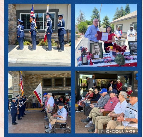
Memorial Day Ceremony