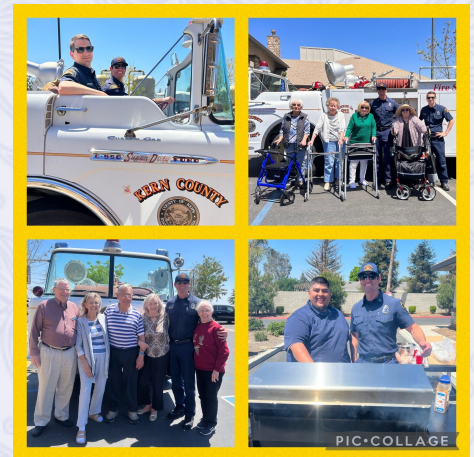
Summers are for BBQ & Friends