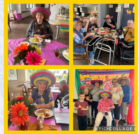
Passport Event to Mexico!